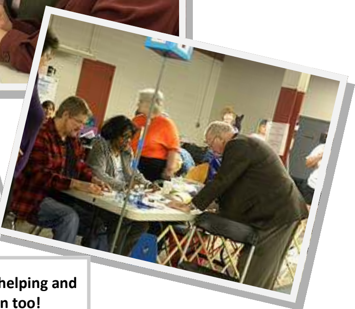
Our members helping and having fun too!