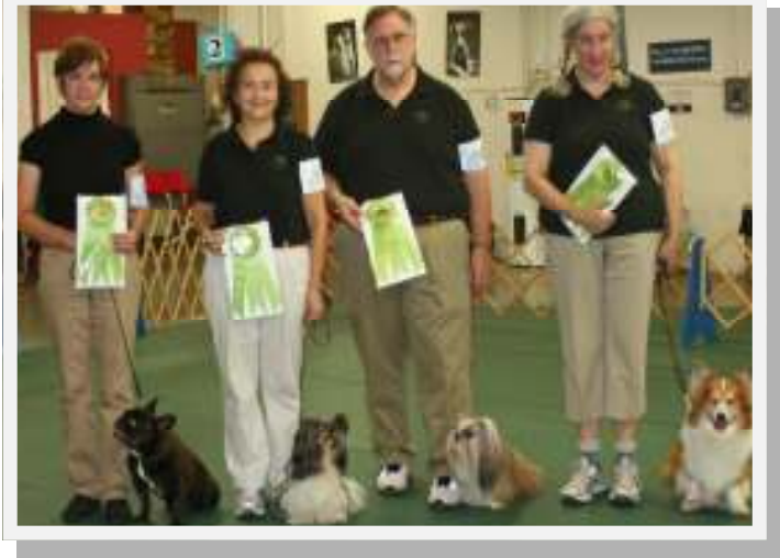
Rally Team: "Small Dog, Big Attitude"

Attendance is down at obedience trials everywhere, as was ours, but we still had a huge turn out. Out of eight hours maximum, one of our judges had 7:43. Our rally entry was up over last year. We brought in a new rally judge, from Richmond. For the first time, I believe EVER, our trial income actually was greater than our trial expenses. When we add in our Trophy Fund and our Trial Fund contributions, we had a very nice net income.