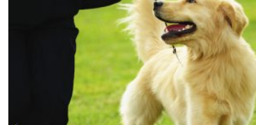
Canine Good Citizen Prep