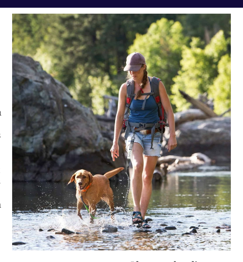
If you are heading out for a longer hike into rougher terrain, consider outfitting your dog with

With Covid-19 restrictions slowly relaxing, you and your best friend are probably yearning to get out and enjoy the great outdoors. If you are going hiking this summer, you need the right gear. If you are a runner or a hiker you will need a leash that attaches around your waist like Tuff Mutt's Hands Free Dog Leash. The four-foot hands free dog leash clips to an adjustable waist belt. You can choose from seven energetic colors.