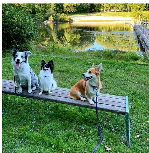
The Wolf Pack, Luna, Hermes and Aspen