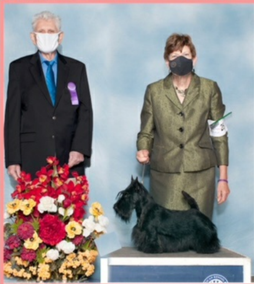
Deblin's Walk This Way X GCHS Merrie Munro's Dark Endora

Top 20 Owner Handled Qualified and NOH Group Placer