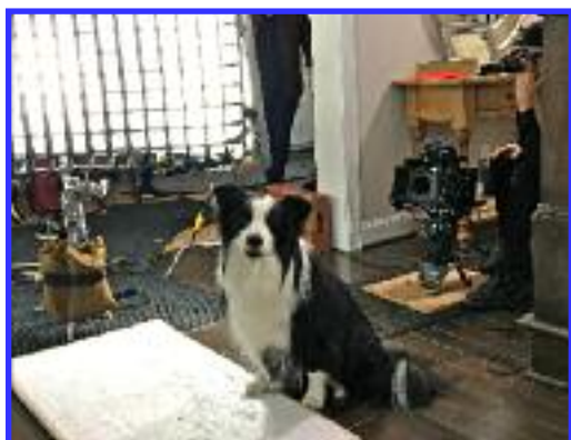
"I'm ready for my close up!" declares Fenway on the set of a US Postal Service commercial. Fenway had to hold a 25 minute out-of-sight sit-stay while the crew blocked the scene and tweaked the lighting. Well done, Fen!