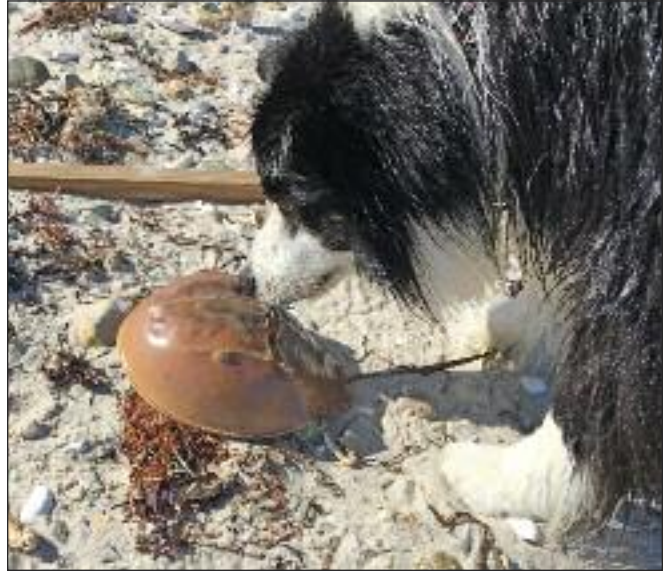
Pam Coblyn's Fenway practiced his scent awareness for utility articles on a dead horseshoe crab.