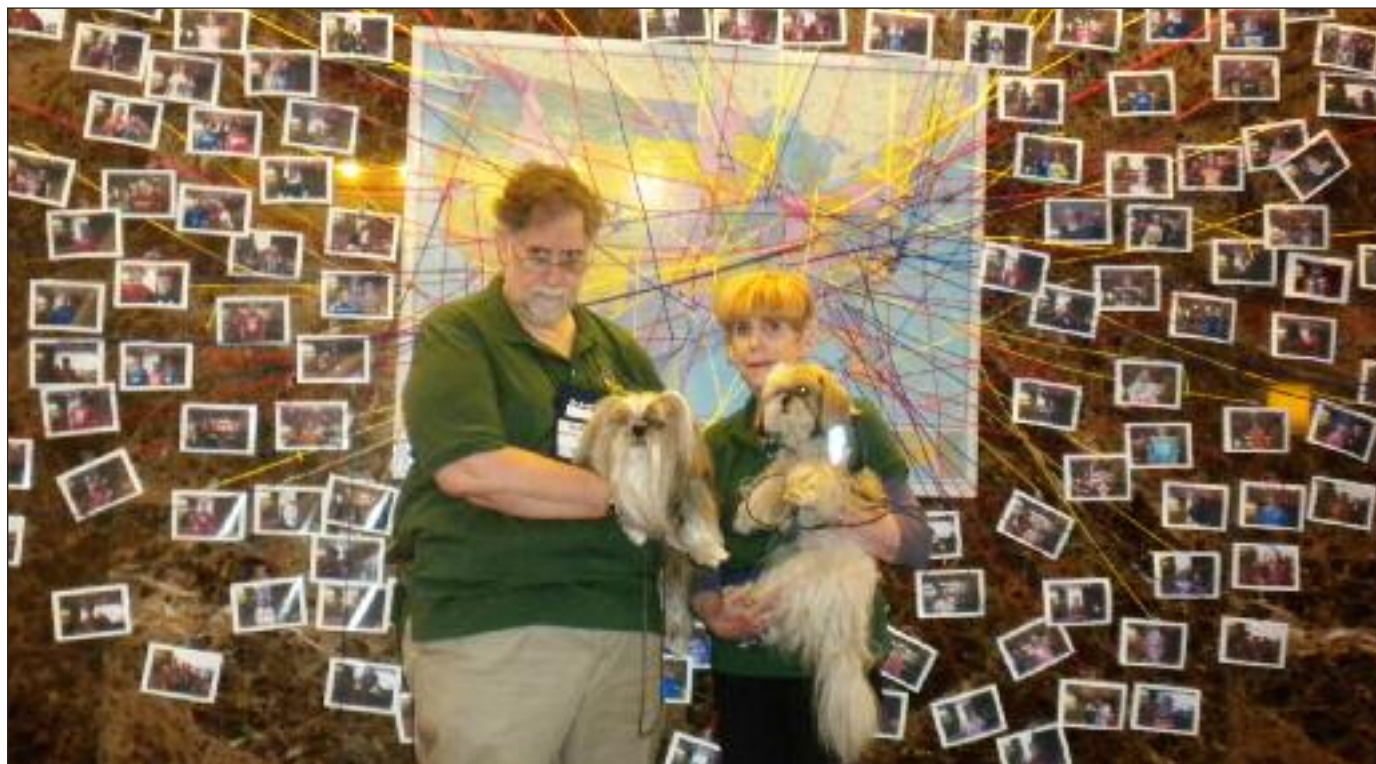
T.A.P.S. Service Map: Tragedy Assistance Program for Survivors.