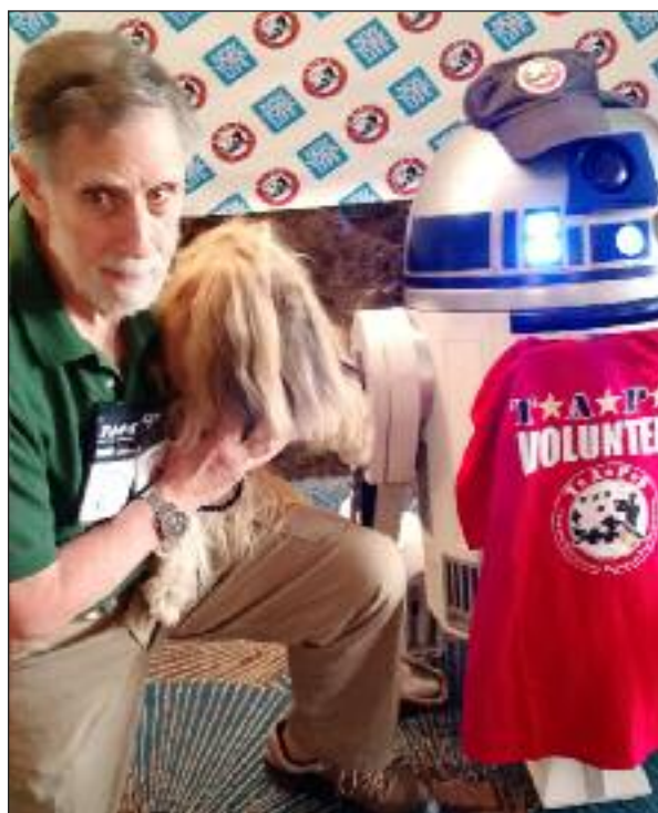
The Bear is impressed by R2D2.